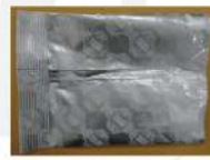
Alum. Back fin bag 鋁箔合掌袋 適用: WVM series