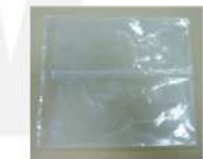
Nylon back fin bag 尼龍合掌袋 適用: WVM series