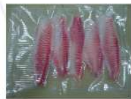
Nylon Channelled (Lined) bag 尼龍條紋袋 適用: WVM series

Special bags for Out of Chamber Vacuum Sealer